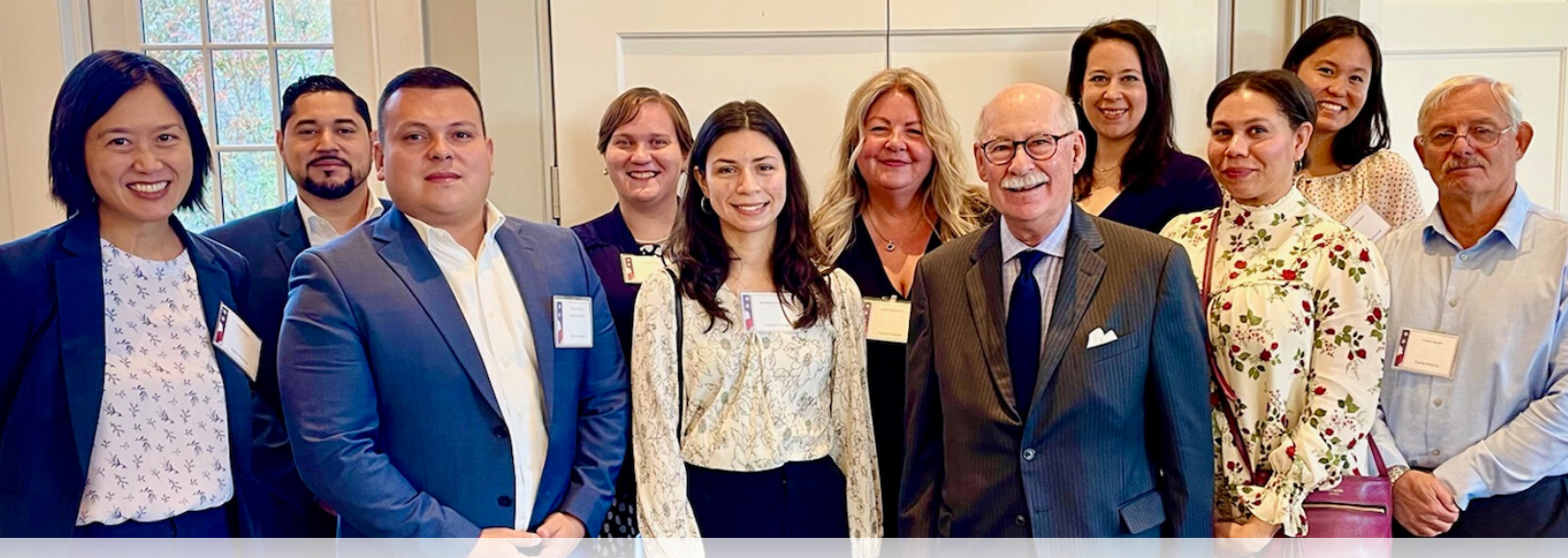
FP Board of Trustees and Staff with Community Partners