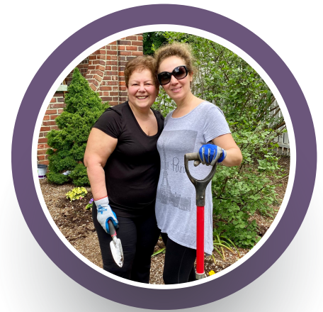
PBF Energy volunteers