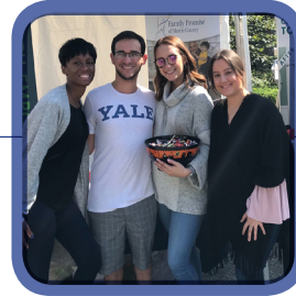
< Family Promise staff at Morristown Festival on the Green