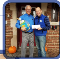
Rotary Club of Lake Hopatcong presents donation >