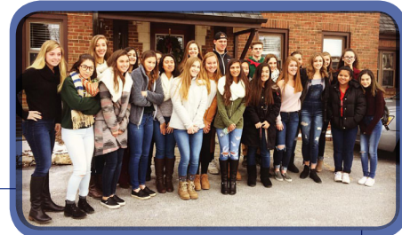
∨ Done-in-a-Day volunteers ^