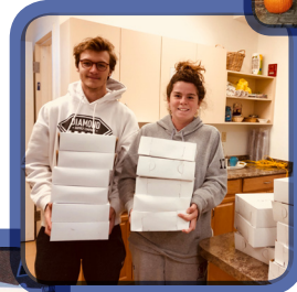
< Emergency Shelter volunteers