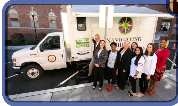
Family Promise staff > and Morris County officials unveil the Navigating Hope Van