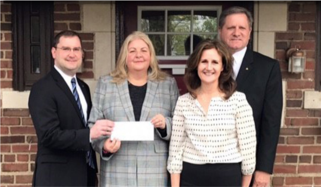
Above: Atlantic Stewardship Bank delivers annual gift Right: Board Secretary prepares for the annual dinner